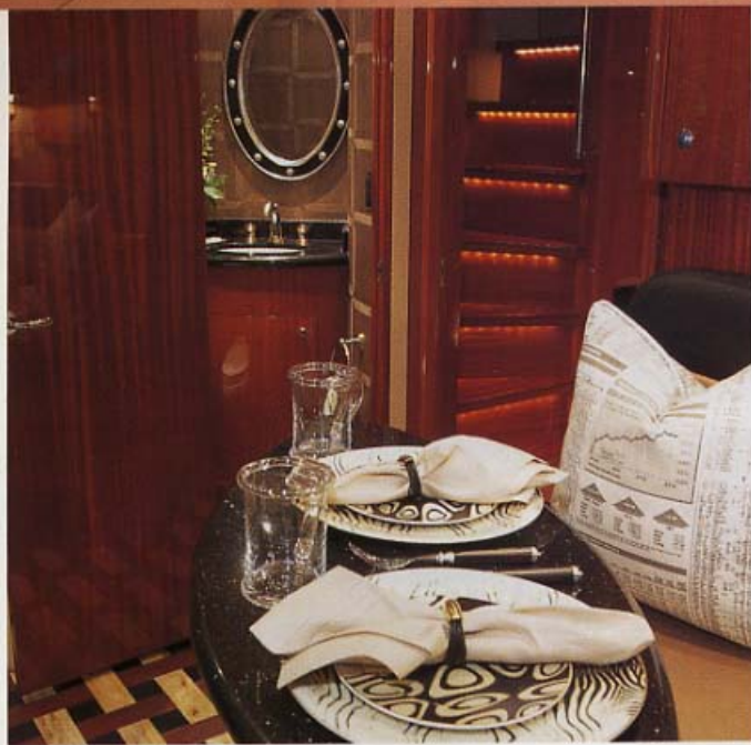
VIP (above) and pilothouse dinette (left)

door hardware and the overall décor. The first hull in the series has an eclectic design that blends traditional pieces with a contemporary look. Five original modern oil and watercolor paintings and black-and-white photographs of American entertainers such as Frank Sinatra, Dean Martin, Paul Newman and Audrey Hepburn adorn the walls.