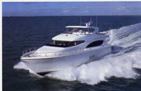
The 80' cruises at 22 knots

Web: hatterasyachts.com Email: sales@hatterasyachts.com